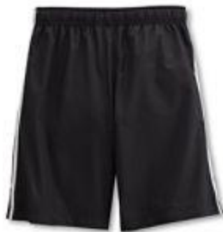
Stripes on Shorts