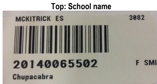
Bottom: Eye Readable Barcode