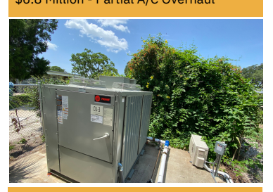
Grady Elementary School $2.4 Million - Partial A/C Overhaul