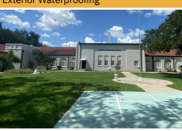
DeSoto Elementary School $ 1.7 Million - Partial A/C Overhaul, and Exterior Waterproofing