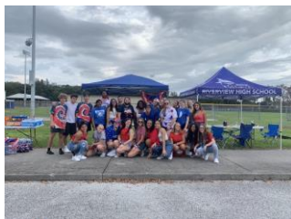
Students celebrating Shark football in a pre-game tailgate.

Click HERE for information regarding admissions for most Florida State University System schools.