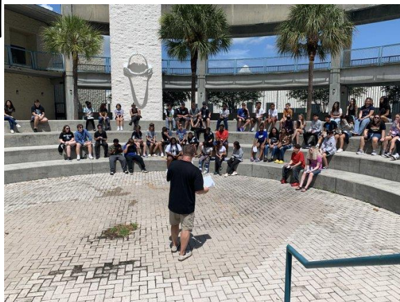
Shark Traditions: Incoming Freshman listening to instructions during Freshman Frenzy

The first day of school for students will be Wednesday, August 10 th , 2022. All students will report to their homerooms first on the first day of school. Look at the personalized information on the postcard mailed to your home to determine your homeroom room number. Homeroom assignments will also be posted on Canvas and in the lobbies of the auditorium and gym.