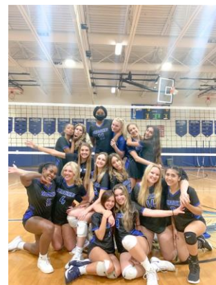
Riverview High School Girls Volleyball team celebrates a successful season.

The Transportation Department has many ways you can access bus run information for your student before school starts. Your student's bus stop location, times, and numbers will be available at the following website: Hillsborough Schools Transportation . It is very important for students and parents to know their bus stop, bus route, bus number, and the bus driver's name . Students are advised to be at their bus stop at least 10 minutes