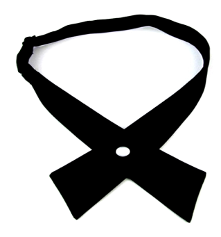
Ties (ascots) can be purchased at Educational Outfitters or during GPA's Open House.